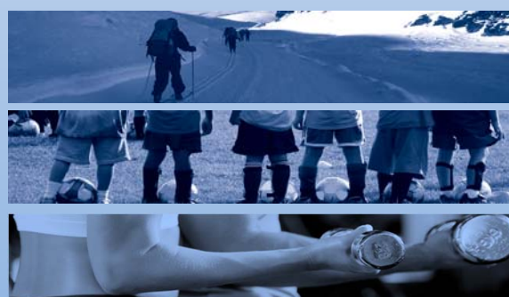
Examples of neutrals images used in OCE studies.

The majority of images that has been used in the web site and in the studies are neutral. Usually images used focus only in body parts and avoid females or male characteristics.